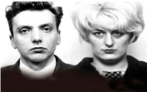
- Ian Brady and Myra Hindley

Choose a serial killer (s) either from the list below or of your own choice: