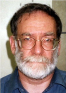
- Harold Shipman