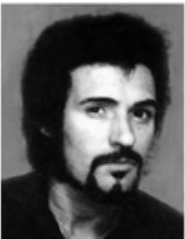
- Peter Sutcliffe (The Yorkshire ripper)