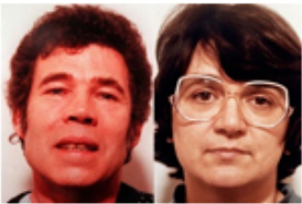
- Fred and Rose West