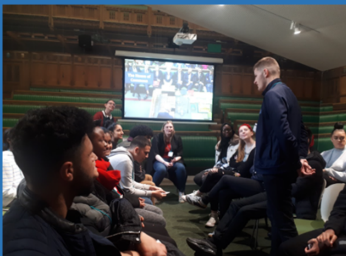
Student debate taking place in the House of Commons